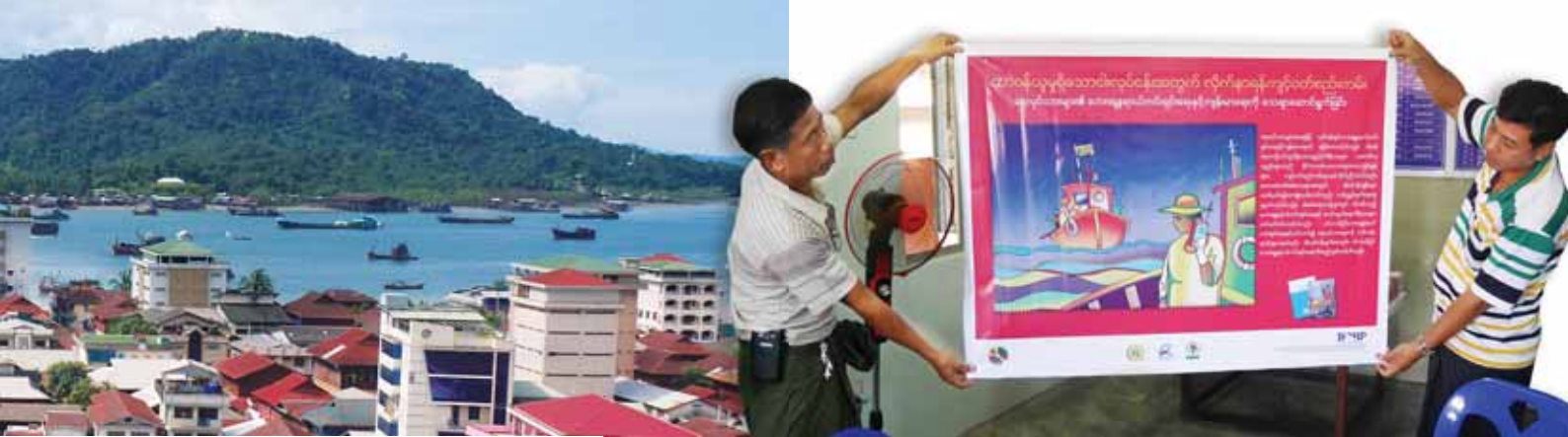
Figure 2 shows some of the issues that we picked up in our recent fieldwork in Myanmar. Two initiatives to improve the meso level are explained in more detail under the next two headings. The Myanmar case is also further expanded in Article 4 'Assessment of meso organisations' from an organisation development perspective.